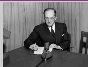
Polish lawyer and human rights activist Raphael Lemkin (1900-1959)